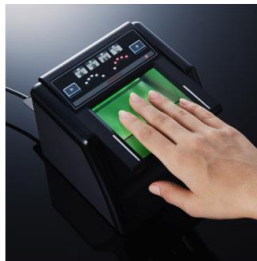
Biometric features captured

Data is fed into MegaMatcher-based CenAFIS software