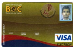
ID Card Printers