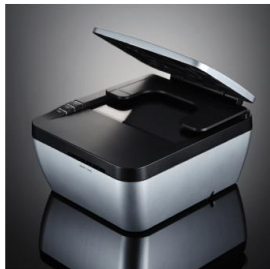
Passport details captured